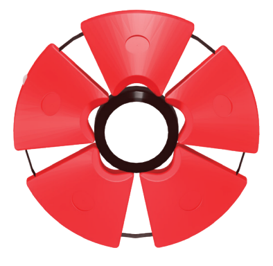
10 inch pipe 5 float units